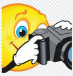
Photo Directory Info

We still want YOU in our Blessed Savior Photo Directory! Tuesday October 8 th , Wednesday, October 9 th and Monday, October 21 & Tuesday, October 22 are now available for scheduling your photo session. Appointments are available from 4:00 pm to 9:00 pm each day. First come, first