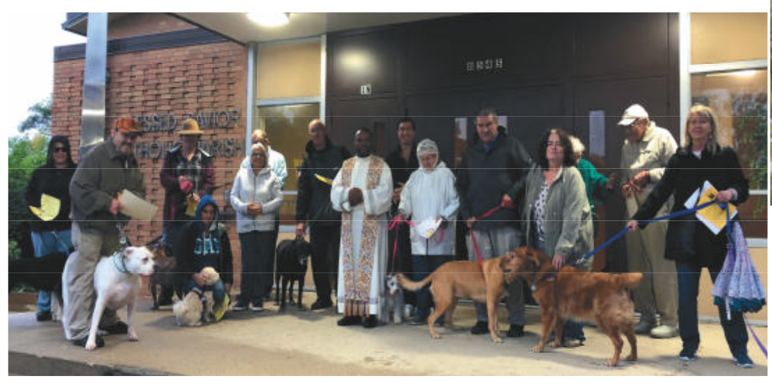
Blessing of Animals, Wednesday, October 2, 2019 Hear our humble prayer, O, God, for our friends the animals.

Mass Times: Saturday, 4PM, Sunday, 9AM Weekdays: Mon. through Wed. 9am in the Chapel