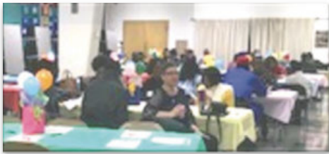
Celebration of Life Gathering after the 9am Mass