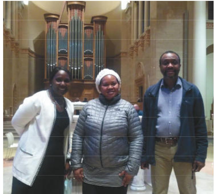
The Rite of Election at the Cathedral on Sunday, February 21, 2021