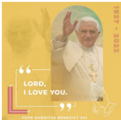
Pope Emeritus Benedict XVI

Eternal rest grant unto him, O Lord, and let perpetual light shine upon him.