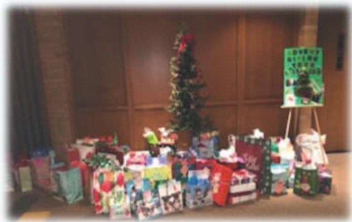
Advent Giving Tree December, 2019