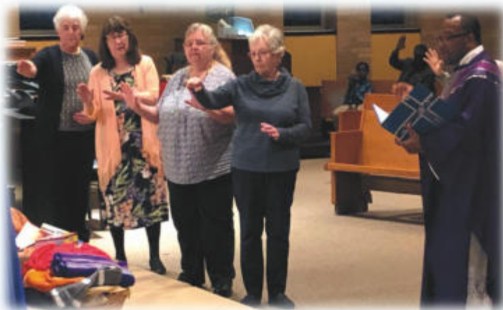
Blessing of Prayer Shawls Saturday, November 30 at the 4pm Mass.

Lord Jesus, may your light shine our way, as once it guided the steps of the magi. May we too be led into your presence and worship you, the Child of Mary, the Word of the Father, the King of nations, the Savior of mankind to whom be glory for ever.