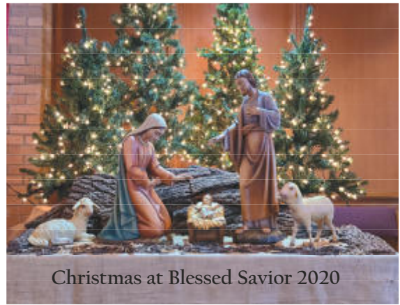
Christmas at Blessed Savior 2020

Just a reminder for those who have not picked up their photo directory. They are available at the parish office.