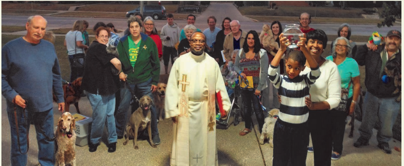
Picture of the Blessing of Pets, Wednesday, October 4, 2017 Feast of St. Francis of Assisi